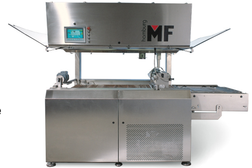
Starcoat easy-clean enrober

MF Hamburg , specializes in chocolate enrobing equipment, tempering machines and cooling tunnels, for the full range of chocolate coating applications in the confectionery, bakery, snack foods and nutrition bar industries. Systems are flexible and can be customized to include special process features and/or special (allergen) cleaning requirements. There will be an enrober on display for you to scrutinize.