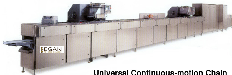
Universal Continuous-motion Chain Chocolate Molding Line