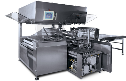
Starcoat easy-clean enrober With removable tempering unit

MF Hamburg specializes in enrobing equipment, tempering machines and cooling tunnels, for the full range of chocolate coating applications in the confectionery, bakery, snack foods and nutrition bar industries. Systems can be customized to include special process features and special (allergen) cleaning requirements. Various tempering machines, enrobers and gull-wing cooling tunnel will be on display.