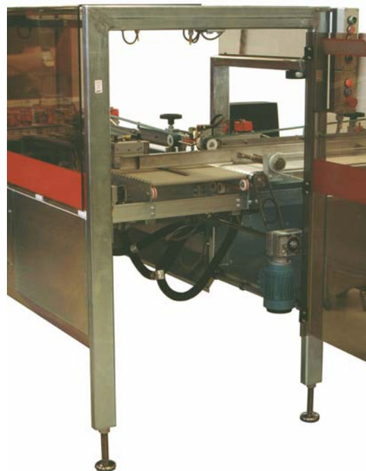
Easy access for maintenance.